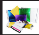
Poly Bags, Mailers & PLE's